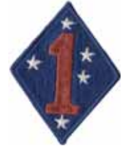
U.S. 1st Marine Div Guadalcanal