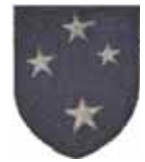
Americal Div Guadalcanal

Two pictures from the war zone, one in Africa, one in Guadalcanal; one in color, one in b/w. A long way from home, the troops in North Africa, plus 15,000 Marines and 15,000 Army that rounded-out Guadalcanal initially, plus another 80,000, represent only a fraction of the 6.4 million in U.S. uniform on Dec. 31, 1942.* The United States was still not at full zenith. But, the American people were beginning to flex their muscle. Both Allies and Axis would meet a dire loss of gruelling battles and a cost of people. In the color picture, troops fire at enemy aircraft. We learned no great victory is possible without air superiority.