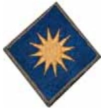
U.S. 40th Inf Div Hawaii